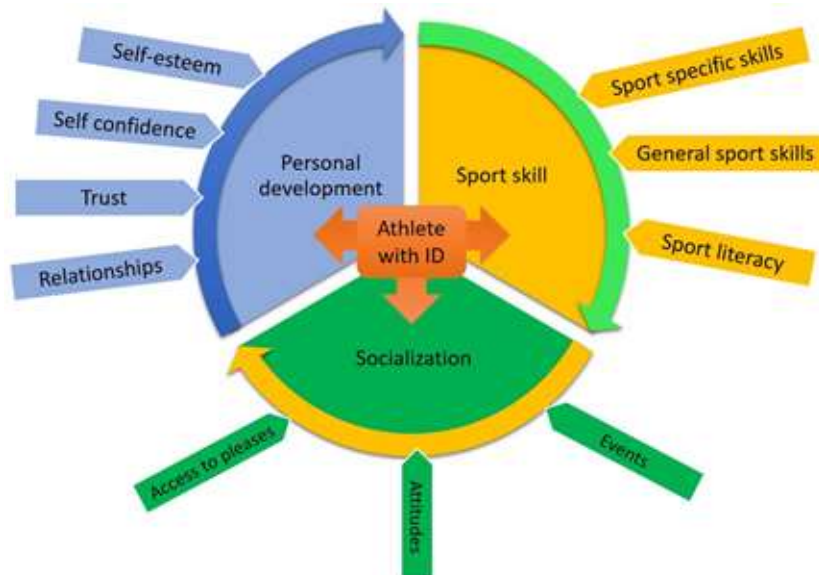
Figure 1. Spectrum of athlete development.

Similar to the global report “Unified give us a chance” (10) we also found significant contribution of our program to the domain of personal development for both athletes with ID and their sporting partners. Personal benefits for the athletes are presented on Figure 1 .